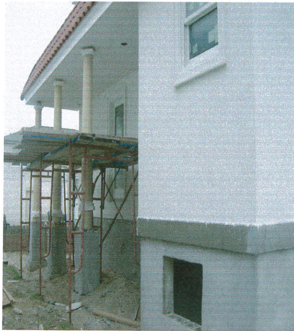
Rear View Date Taken: 04/09/2008