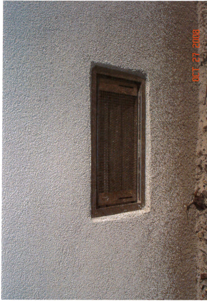
3009 Pacific Ave., Longport # 29779