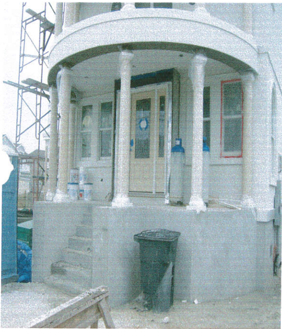
Front View Date Taken: 04/09/2008